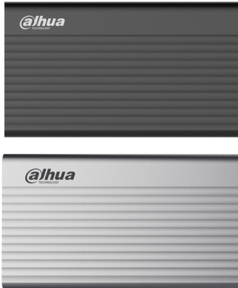
Dahua Portable SSD T70