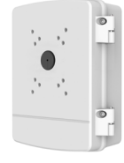
PFA140 Water-proof PowerBox