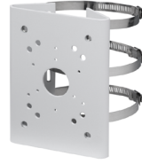
PFA150 Pole Mount