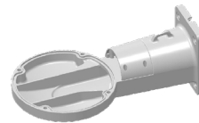
DH-PFB731W Wall Mount